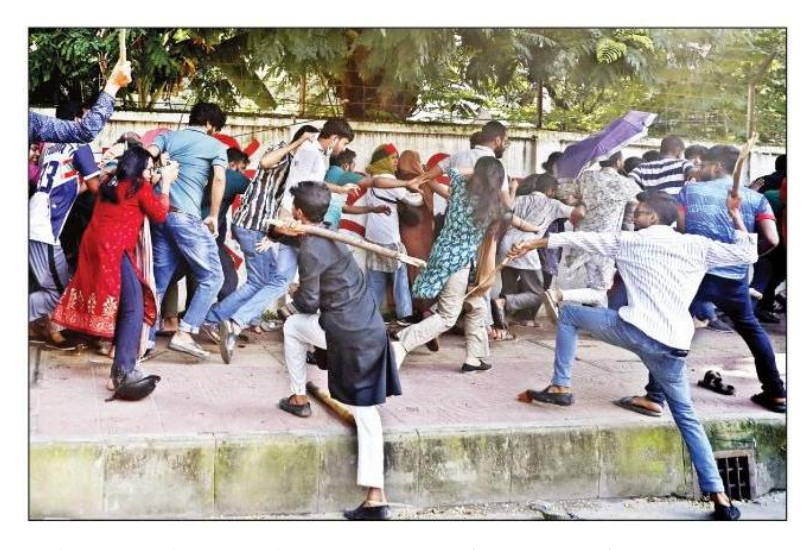
Chhatra League members attacking students protesting for quota reforms in government jobs at Dhaka University. Photo: Jugantor, 16 July 2024.