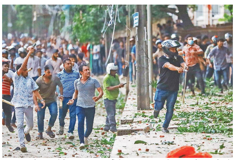
Three Chhatra League members with guns, seen firing at protesting students during clashes at Dhaka University. Photo: Prothom Alo: 16 July 2024.