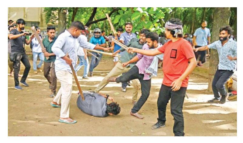
Quota reform movement protesters being attacked at Dhaka University campus by Chhatra League. Photo: Samakal, 16 July 2024.